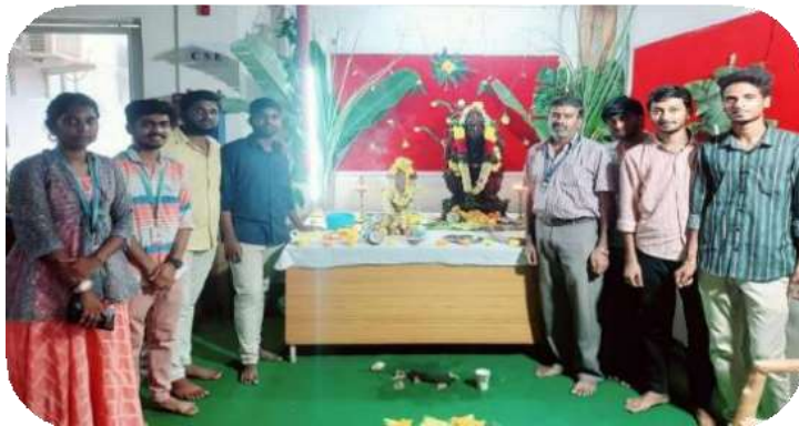
Vinayaka Chavithi Celebrations (16-9-2023)