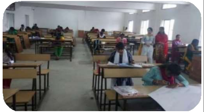
Drawing Competition for children's day in association with TV99 Channel (29-09-2023)