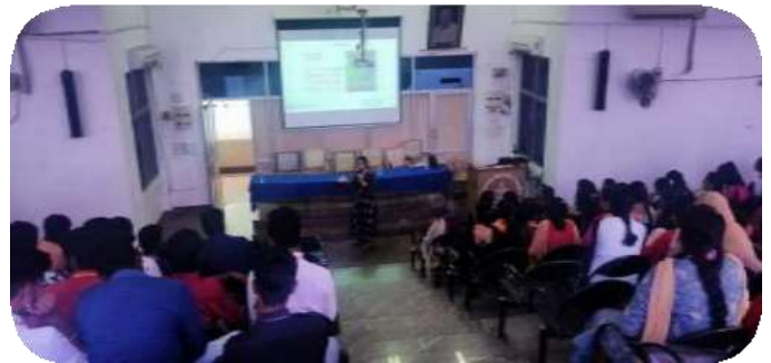
Workshop On "MATLAB for Image Processing Applications and Introduction to ML & DL"(14-12-2023)