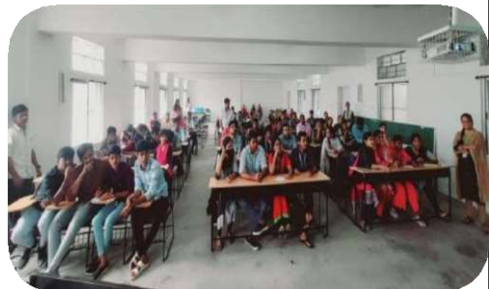
World Television Day (21-11-2023)