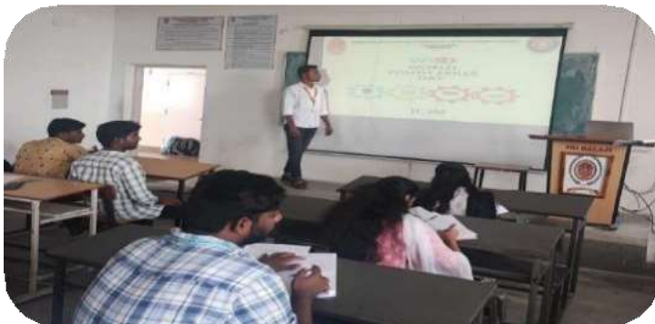
WORLD YOUTH SKILLS DAY (15-7-2023)