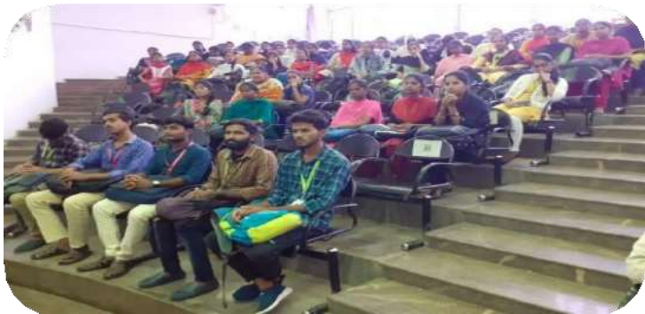
National Education Day (11-11-2023)