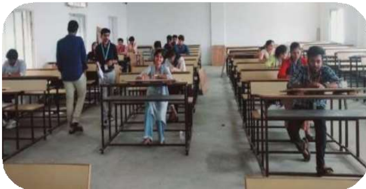
Essay writing competition organized by Sri Sathya Sai trust, chittoor (04-10-2023)