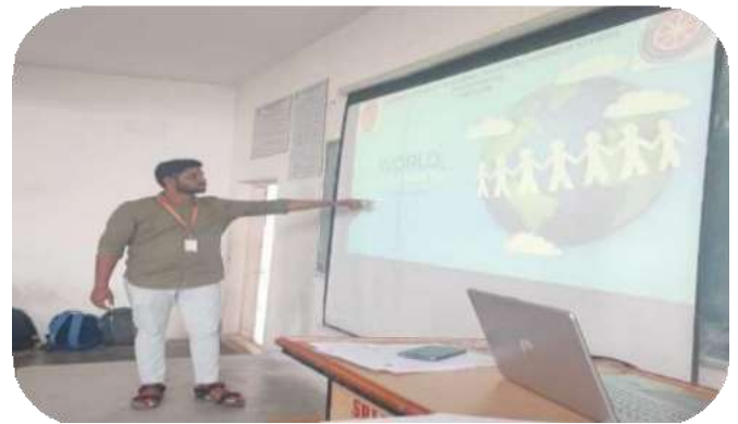
WORLD POPULATION DAY (11-07-2023)