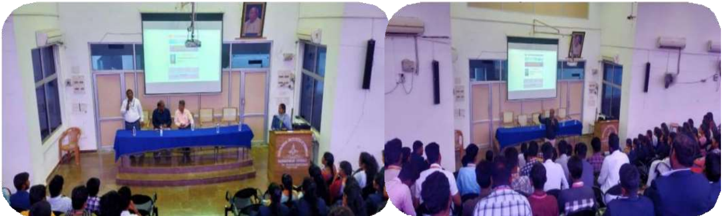
"My Story-Motivational Session by Successful Entrepreneur/Startup Founder"(17-11-2023)