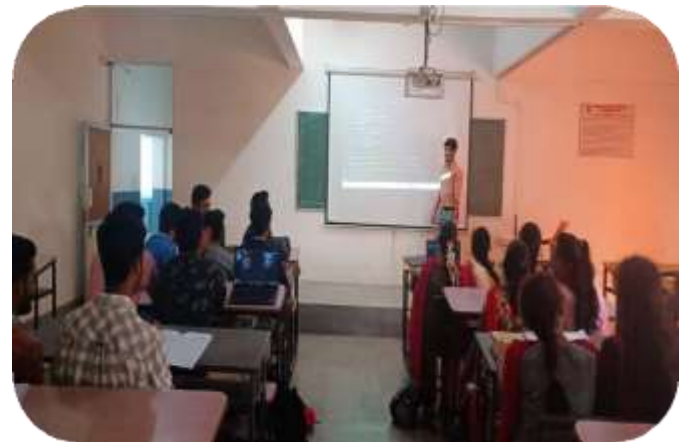
Placement Training Program (15-11-2023 to 15-12-2023)