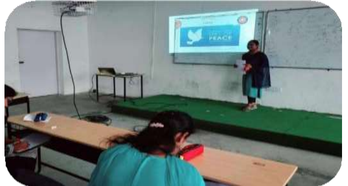
International Day of Peace(21-9-2023)