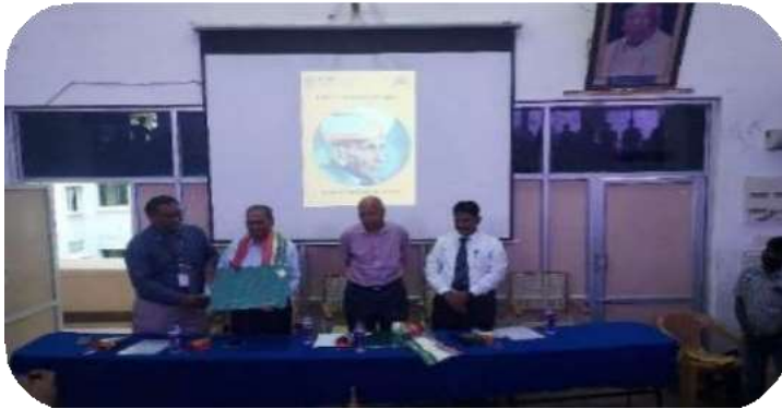
ENGINEERS' DAY (15-09-2023)