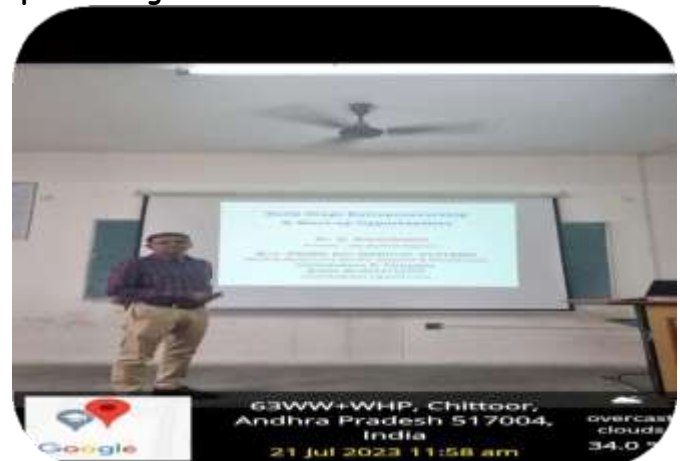
Early State Entrepreneurs-An Opportunity to students & Faculty (21-07-2023)