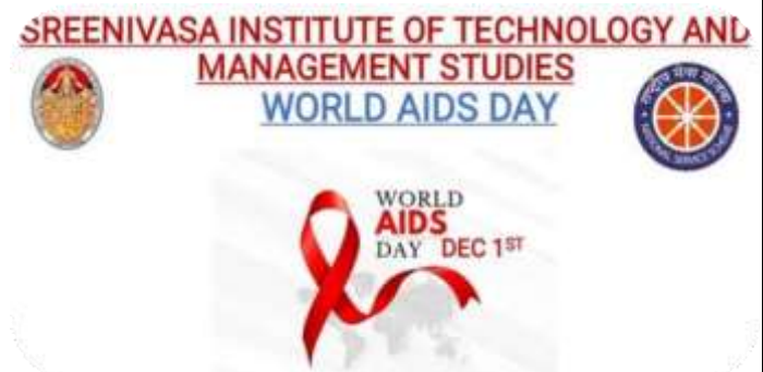
World AIDS Day(01-12-2023)