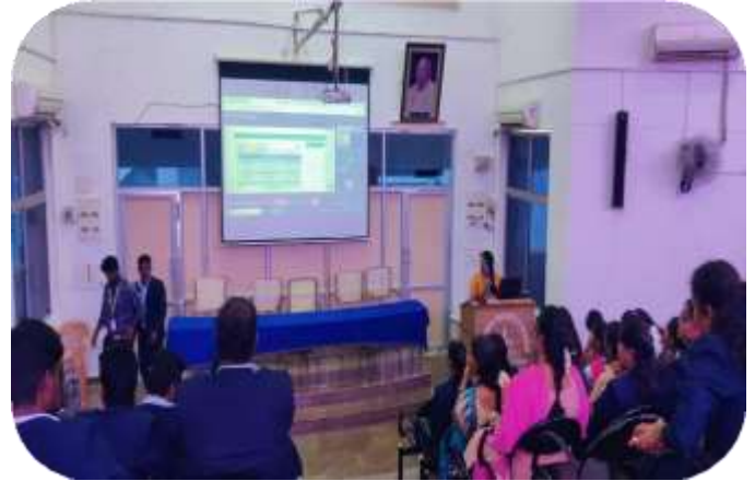
International Webinar on How to Apply Taiwan Scholarships , Masters and Ph.D"(24-11-2023)