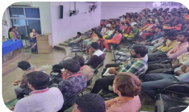
Industrial Expert Session on "Electronic Products Manufacturing - an Insight" (26.07.2023)