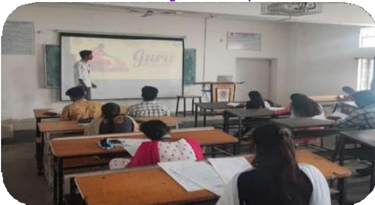
GURU PURNIMA (03-07-2023)

Our students as NSS Volunteers continuously showing leadership skills and serving rigorously for community health care, literacy drives, environmental protection, Blood donation camps, informative lecture on human values regularly to the society by visiting nearby villages and educating and helping the poor and the destitute. This time NSS has also organized many activities.