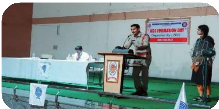
NSS Formation Day (25-09-2023)