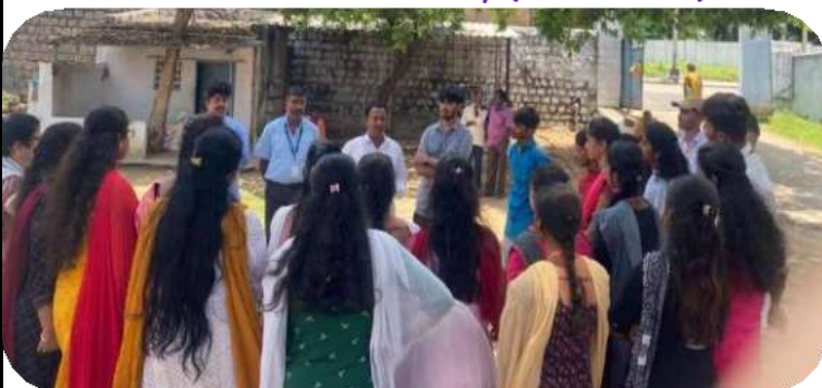
Constitution Day of India (26-11-2023)