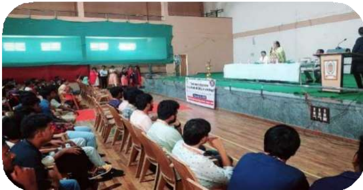
Awareness Program on evil effects of I D Liquor & Drugs (26-09-2023)