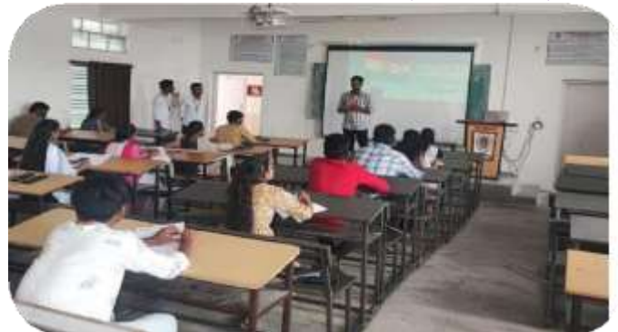
NATIONAL FLAG ADAPTATION DAY(22-07-2023)