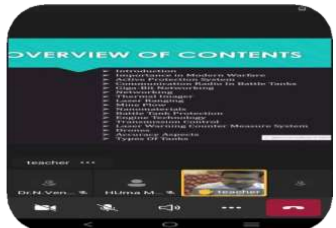
National Webinar on "Advanced Defence Technologies, For Land Based Combat Vehicles" (08-09-2023)